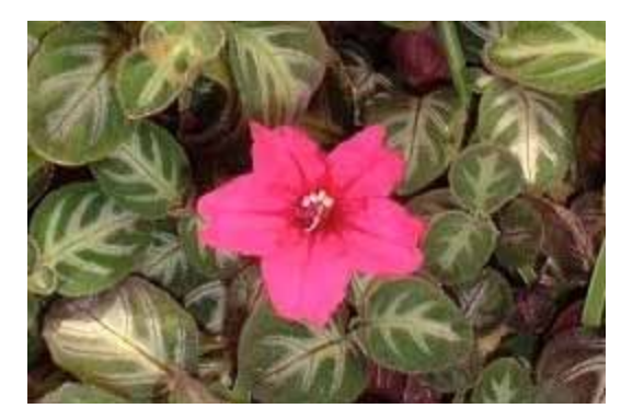
"Heroic Action" (ruellia makoyana)