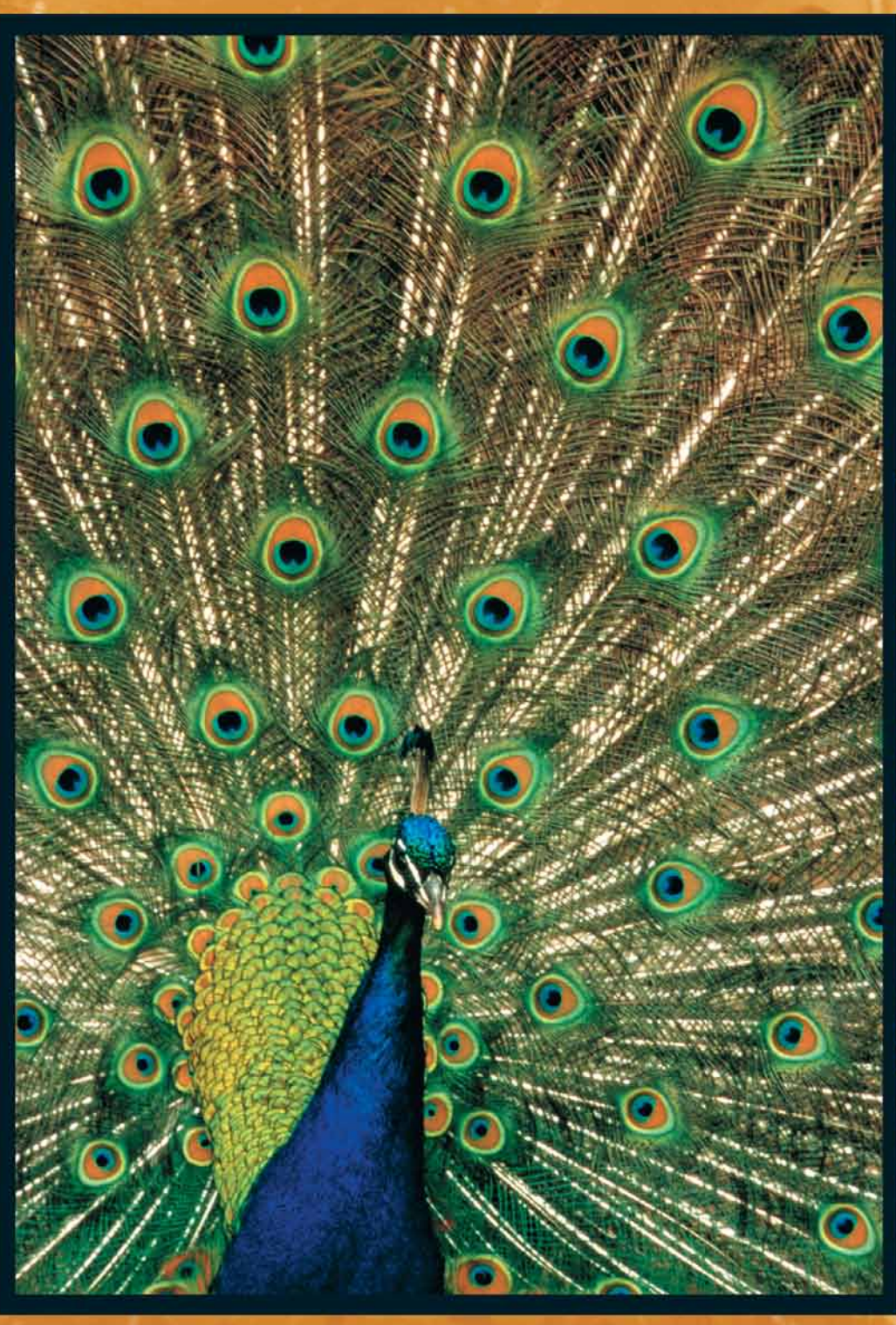
THE INTEGRAL KNOWLEDGE STUDY CENTER 15 August 2010 • Volume 19, No. 3