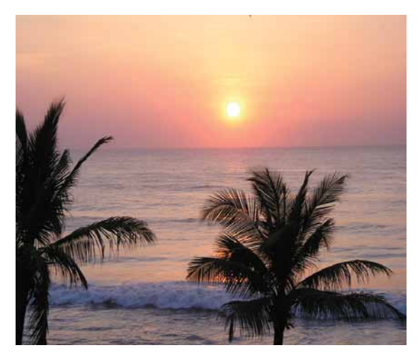
Sunrise in Pondicherry

Before dawn comes, begin well. Sit for meditation, concentrate intensely, summon and marshall self-awareness. The effort to consecrate the nature evokes the hidden deity. From its deep and felicitous composure, the dynamic soul comes forward more and more, day by day, ensphering, enriching, and offering every aspect of the natural being. The offering enables the climb. The dawning awareness of the soul empowers the lift: our active life expresses the aspiration, the process of progress, the finding of light, the scattering of darkness, the fulfilment of union, yoga.